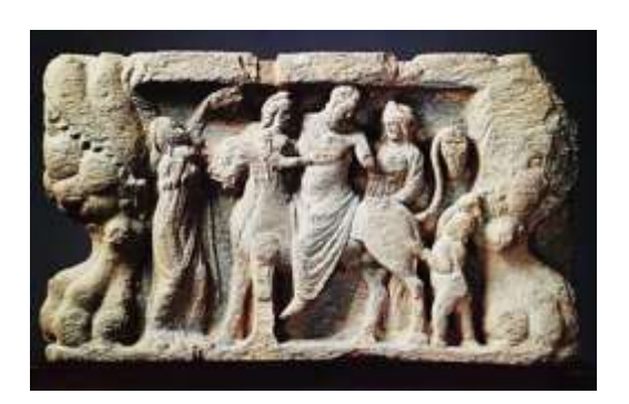
Figure 12 A baechanalion scene of two couples busy in merry making over a bowl of wine, Provenance: unknown, Schist, Dimensions: Ht. 20 in. Wd. 9 in, Dt 3 in, Accession No G-167. Source: Displayed in the main hall of Lahore Museum.