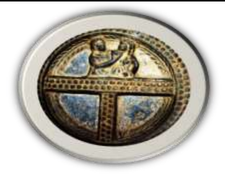
Figure 15 Comb drinking scene, Provenance: unknown, wood, 7.4*8.8 cm. Source: Gandharan Art from the Hirayama collection. 2003, Accession no 104657. P. 240. Fig.VI-69.