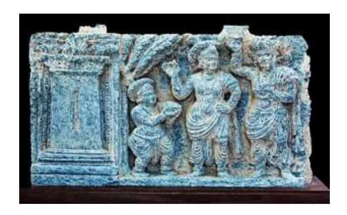
Figure 6 Love drinking scene, Provenance, unknown, grey schist, Dimensions: Ht, 20 cm, Wd. 27 cm, Source/Ref: oriental Museum Tokyo, Kurita.I, Gandhara Art II. 2003. Fig.563. P.194