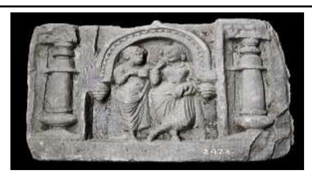
Figure 14 Toilet tray with drinking scenes, Provenance: 3^{\rm rd}-4^{\rm th} Century AD, Stone, dimensions: Ht. 14 cm. Wd. 14.3. Wt. 0.5 Kg, Accession No PM-03173, Source: Displayed in Western gallery of Peshawar Museum.

Figure 13 Wine drinking couple, Dimensions. Ht.25 cm, Wd 25 cm, Source/ Ref: Calcutta Museum India.