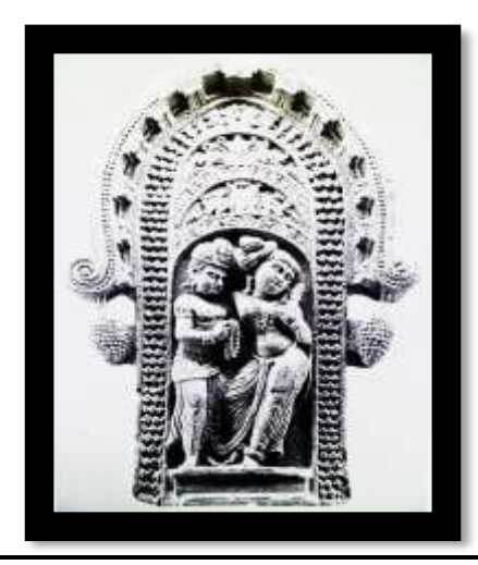
Figure 8. A loving couple, Provenance, unknown, Schist, Dimensions: 42.7*15.8 cm, Source/Ref: Tanabe. Katsumi, Gandharan Art from the Hirayama Collection , 1984, Accession no. 103122. Fig.6. P. 70.

Figure 7 A Loving couple, Provenance, Butkara, Swat, Green schist, Dimensions, Source: I. Kurita, Gandhara Art , Vol. II. 2003. Fig. 569.P. 197.