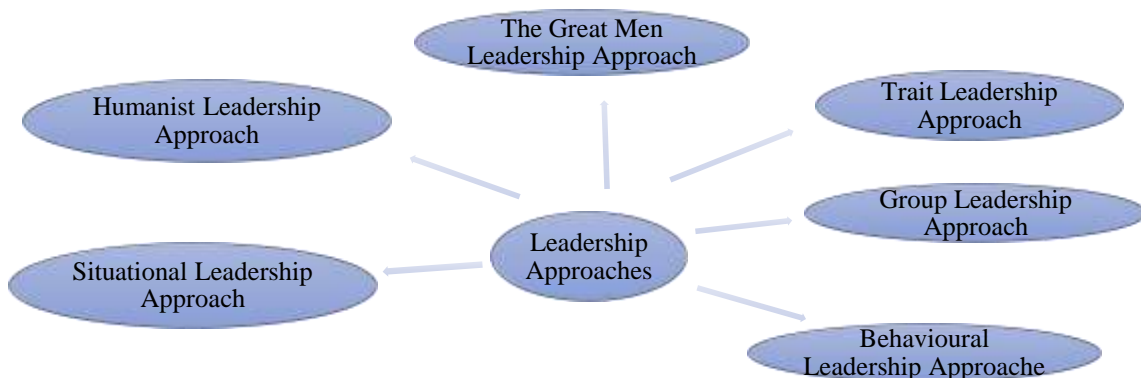
Figure 2: Approaches of leadership

This diagram was created using a literature review of various research papers on leadership approaches. The current study illustrates the different leadership approaches, such as the Green Men leadership approach, trait leadership approach, group leadership approach, behavioral leadership approach, situational leadership approach, and humanist leadership approach. The school's leaders and principals should study these leadership approaches to understand their roles in this ever-changing world. They can adopt various approaches to deal with different situations and challenges that they come across in their day-to-day responsibilities.