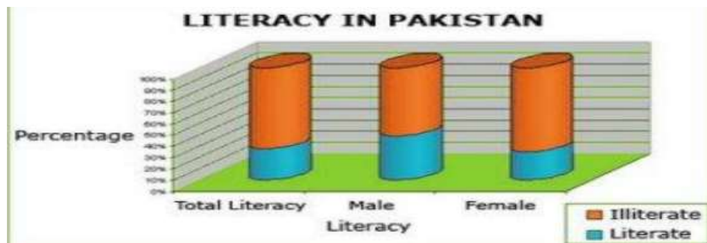
Figure 1: Statistical representation of the overall population

Following is the statistical representation of the overall population in terms of literacy.